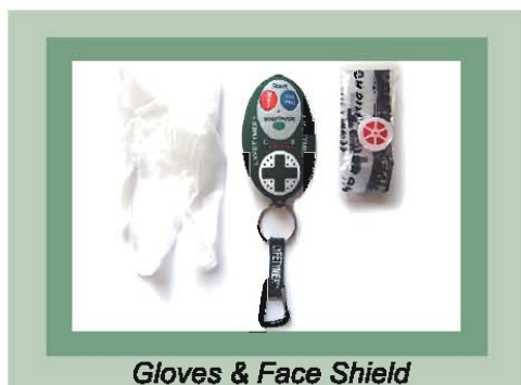
Gloves & Face Shield